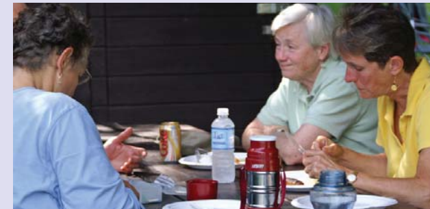
SAGERS eat at the 2006 picnic at Oneida Shores.

and the fixings, and you bring games, lawn chairs, guitars, and lots of energy. This year the picnic will again take place at Oneida Shores Park in Brewerton, NY. The August Newsletter will feature more details, as well as a map and directions to the event.