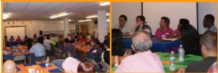
At the September potluck, Sage Members, Syracuse University Students, and Q Center Youths discussed what has been like to be LGBT in different eras.